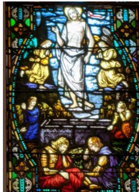
"The Resurrection" Titian Stained-glass window in the Sanctuary